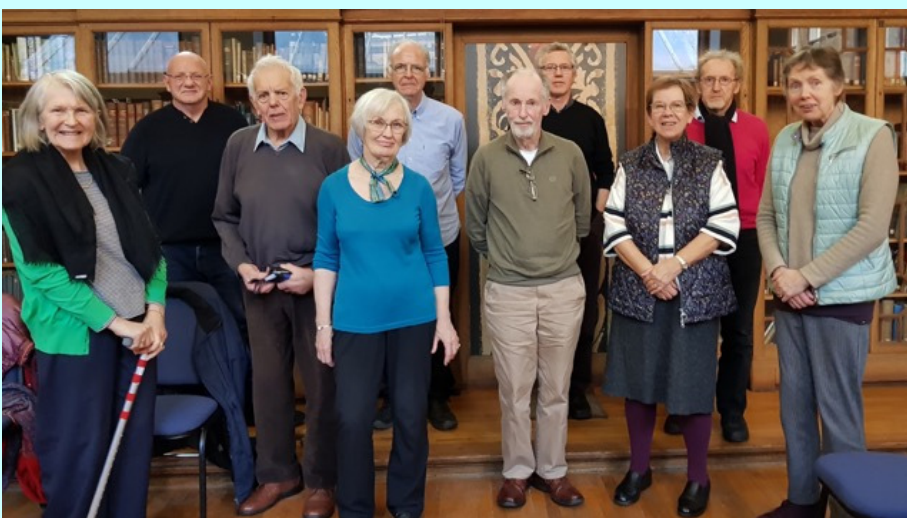
The first meeting of our new Quality of Life Group